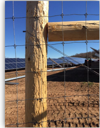
Example of agricultural style fencing