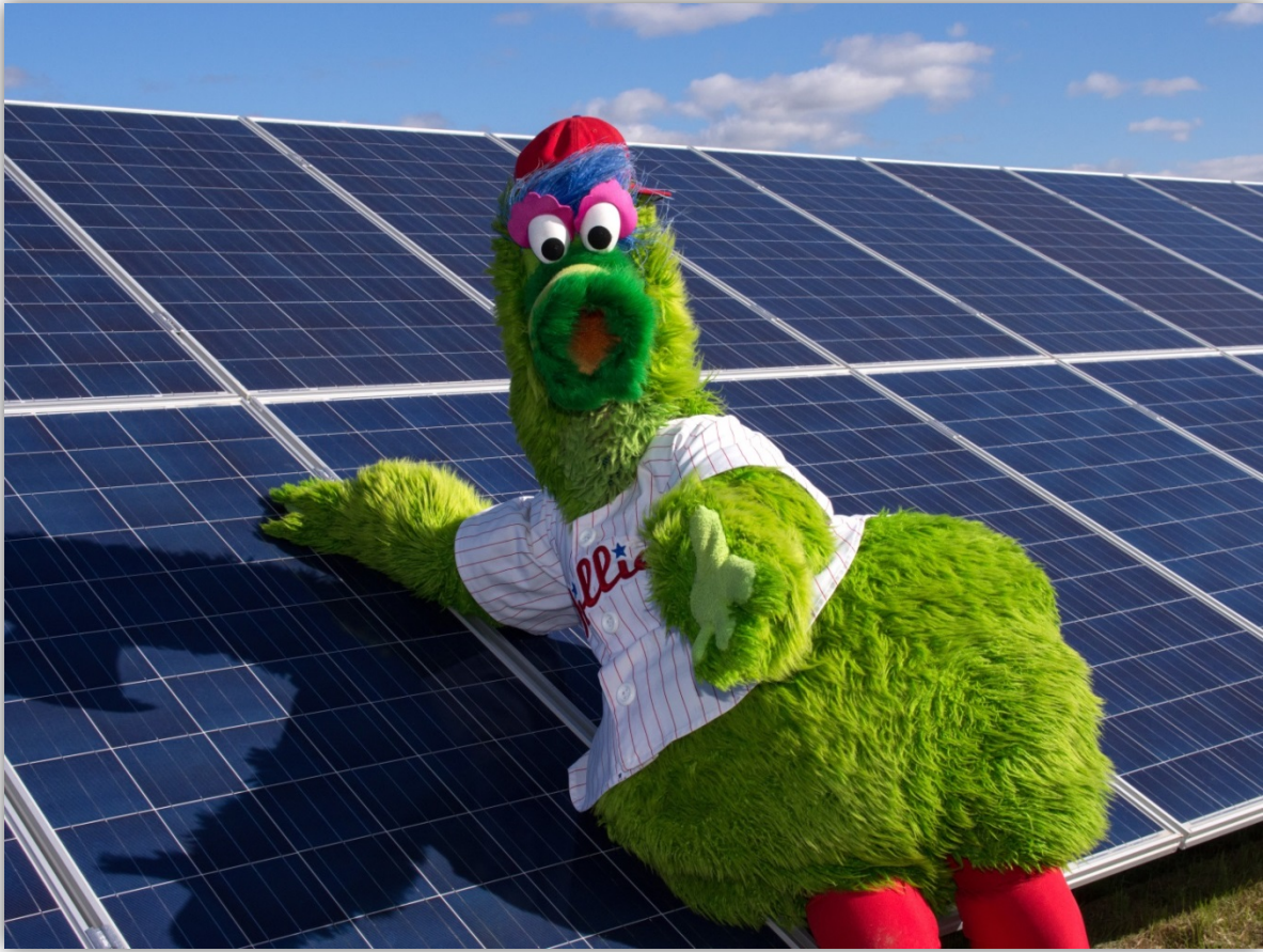
The Philadelphia Phillies Phanatic in attendance at the Keystone Solar “Turn the Power On” event on October 2012 in Lancaster County, PA.