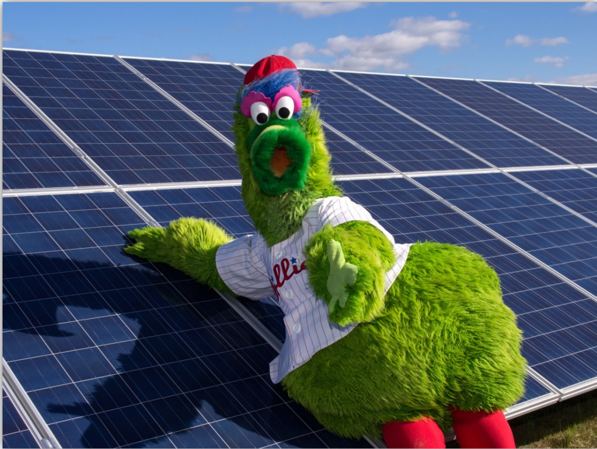
The Philadelphia Phillies Phanatic in attendance at the Keystone Solar “Turn the Power On” event on October 2012 in Lancaster County, PA