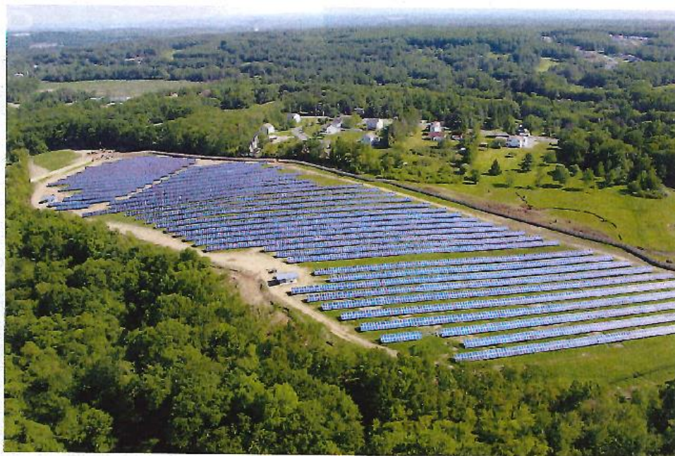
One of two 1 MW solar projects Community Energy developed for the Town of Sterling, Mass.

Solar projects for municipal customers are typically on a similar scale as those for commercial enterprises but come with their own sets of rules. Developers seeking to serve this active and growing market must master a rigorous and often long procedure-driven process. Moreover, this process is by definition under intense and even skeptical public scrutiny because such projects are