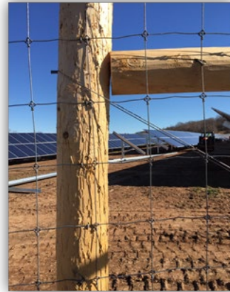
Example of agricultural style fencing