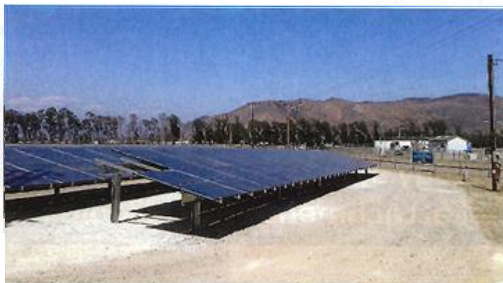
REC Solar developed this 1 MW PV installation for a jail facility in Ventura County, Calif.

Understanding the specific dynamics of different forms of local government and then developing an appreciation of the personalities involved are perhaps the most challenging aspects of dealing with municipalities as customers. Is it an election year? What else does the government have on its plate? Har-